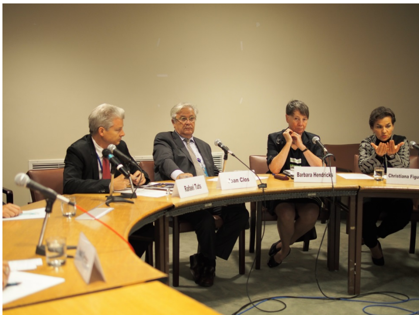
City Policy Room