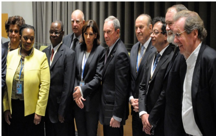
Cities Action Announcements